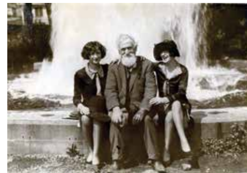
Hudson Maxim, 1925

The Hopatcong State Park fountain restoration effort has truly showed what the Lake Hopatcong community is capable of – from the volunteer efforts to donations, support of a Beefsteak Dinner at St. Jude's Church, and the generous support of the Verhalen, Szigethy and Kellogg Foundations – it was a great team effort. Combined with amazing support from Morris County, New Jersey State Parks and an amazing professional and contractor team, Lake Hopatcong's fountain is back!